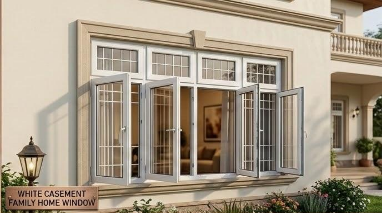
WHITE CASEMENT FAMILY HOME WINDOW