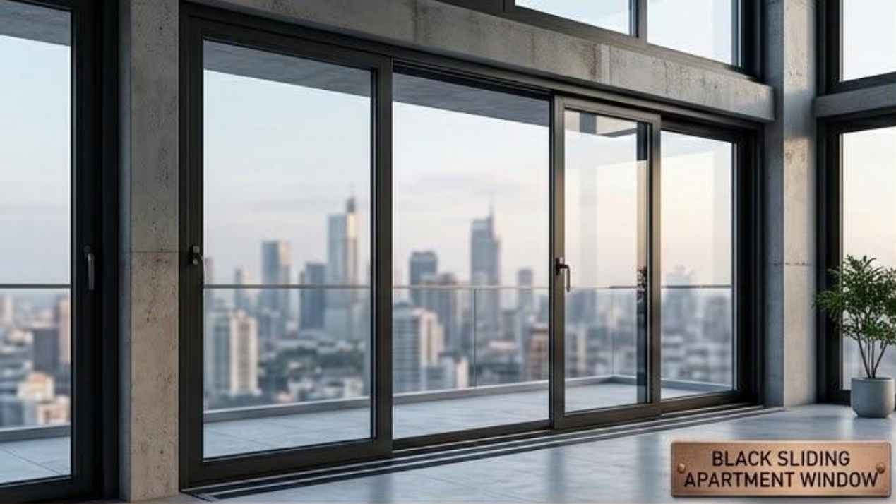
BLACK SLIDING APARTMENT WINDOW