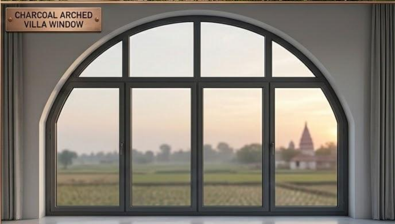
CHARCOAL ARCHED VILLA WINDOW