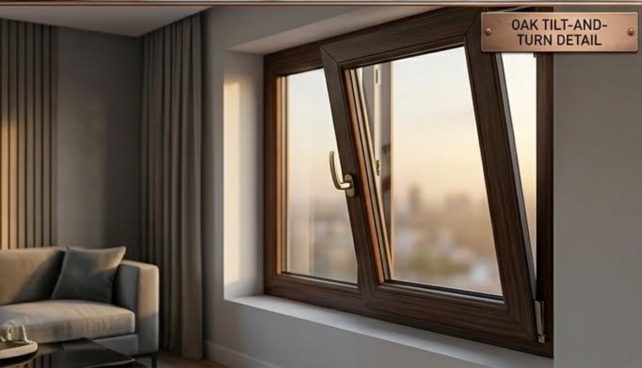
OAK TILT-AND- TURN DETAIL